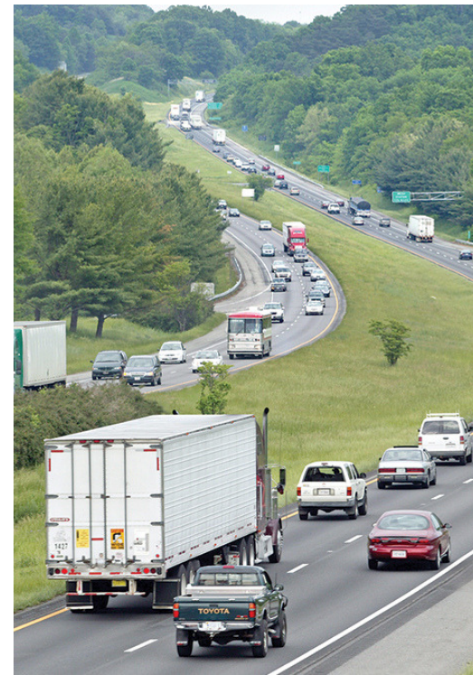
I-81 has the highest proportion of incident delay compared to all other VA interstates